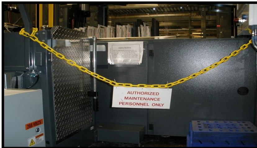
Maintenance Access Only Area

All non-maintenance personnel are restricted from the ITC Verticalizer and Stacker/Loader Area. One side has been identified as "Off Limits" by the addition of the yellow Maintenance Access Only chain. The other side of the ITC Stacker/Loader Table has also been identified as Maintenance Only. All non-maintenance personnel are restricted from these areas. In the event of a jam occurrence within the ITC Stacker/Loader Area, please notify a maintenance employee immediately.